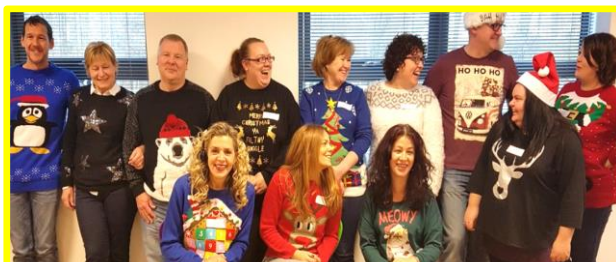
Jingle Build December