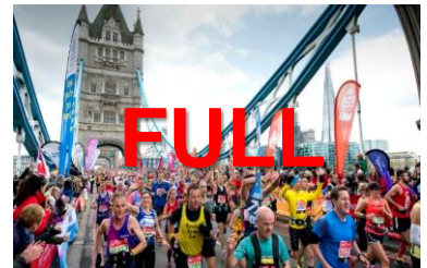
Virgin London Marathon 8 th April