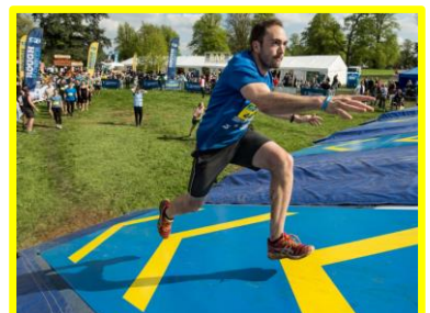
Rough Runner – NE 21 st -22 nd July