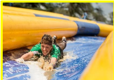
Rough Runner – London 8 th -9 th September