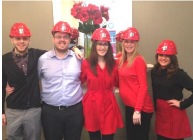
Have A Heart Appeal 14 th February