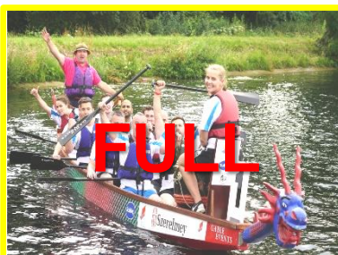
Dragon Boat Challenge 21 st June