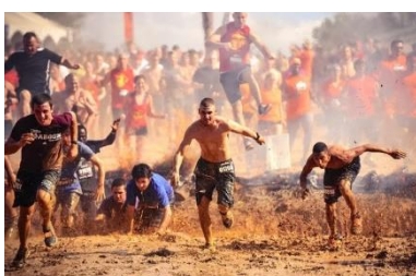
Spartan Sprint 24 th June