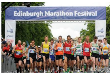
Edinburgh Running Festival (multi distance) 26 th -27 th May