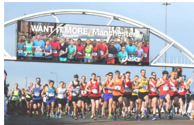
Manchester Marathon 8 th April