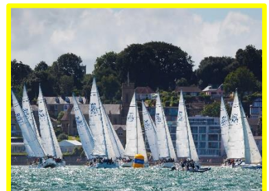
Sailing Cup Challenge 7 th June