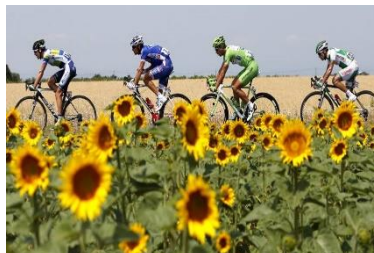
Anney Cycle Challenge 4 th -6 th October