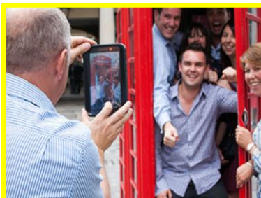
Wildgoose Chase 27 th September