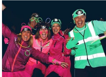
Supernova Run 3 rd March