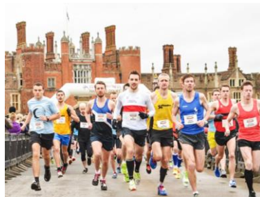
Hampton Court Half 18 th March