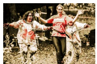
Zombie Evacuation 15 th September