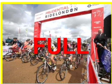
Ride London 29 th July