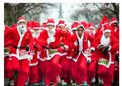
Santa In The City 5 th December