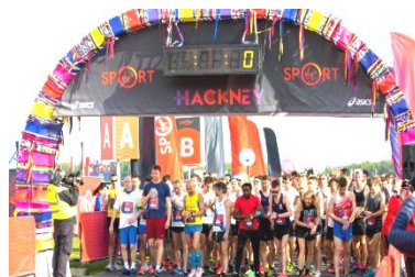
Hackney Half Marathon 20 th May