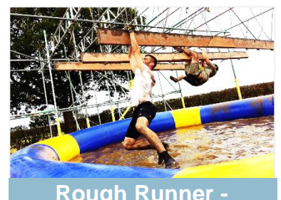
Rough Runner - Edinburgh 18 th -19 th August