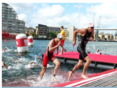
London Triathlon 4 th -5 th August