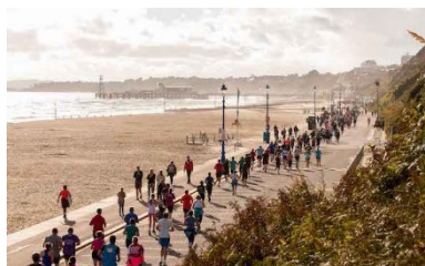
Bournemouth Half & Marathon 7 th October