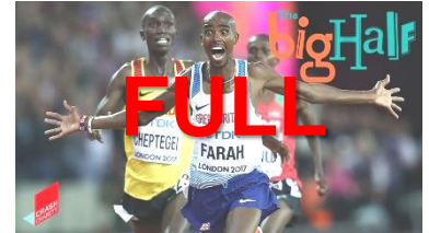
The Big Half 4 th March